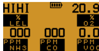
Display in alarm conditions