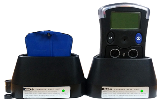
Long duration battery pack and instrument with fast charge battery pack, charging in Fast Charger master / slave units.

As an ISO 9001 approved company, Gas Measurement Instruments quality assurance programmes demand the continuous assessment and improvement of all GMI products. Information in this leaflet could thus change without notification and does not constitute a product specification. Please contact GMI or their representative if you require more details.